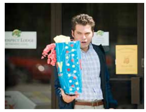
More photos available at http://lamportsheppard.com/roz.php